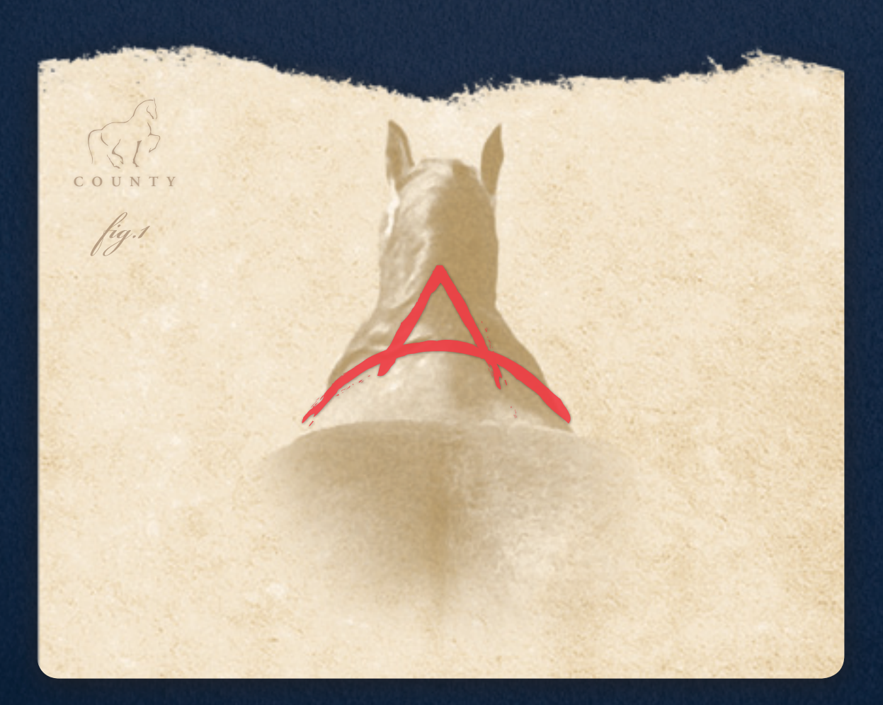
For Saddles that Fit Contact Your Nearest County Representative

Because the shape of a narrow horses withers is very different than the shape of a medium, wide, or extra wide withers, simply replacing the head (front) of the tree with a wider version of the same shape does not solve the problem. For example, if a narrow horse's withers are shaped somewhat like a triangle and a wider horse's withers are more rounded, simply widening the triangle shape is no solution. Not only does the shape not conform to the withers shape, but the result is often rocking or uneven contact along the points and legs of the tree.